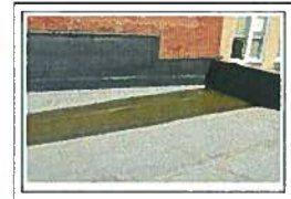
PHOTOS: ROOF AREA 5

ROOF AREA 5: ± 13,900 S.F. 3 STORY ROOF TYPE: FULLY ADHERED EPDM - WOOD DECK CONTRACTOR: CUDAHY ROOFING MAINTENANCE & REPAIRS: 1996 WARRANTIES: 1. 11-10-96 SCHULLER (MANUILLE) ROOFING SYSTEMS - 20 YEAR MATERIAL WARRANTY; # 101936 2. 11-10-96 SCHULLER (MANUILLE) ROOFING SYSTEMS - 15 YEAR "GOLD SHIELD" WARRANTY #BN50742151 3. 9-1-96 CUDAHY ROOFING & SUPPLY - 3 YEAR LIMITED SHEET METAL WARRANTY