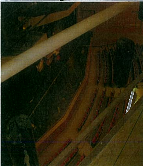
Picture 1- View of Railing

In addition, Glenbrook South has a smaller catwalk system that needs a similar lifeline, harness system. The cost is $5,800. This expense will be covered by discretionary funds included in the budget.