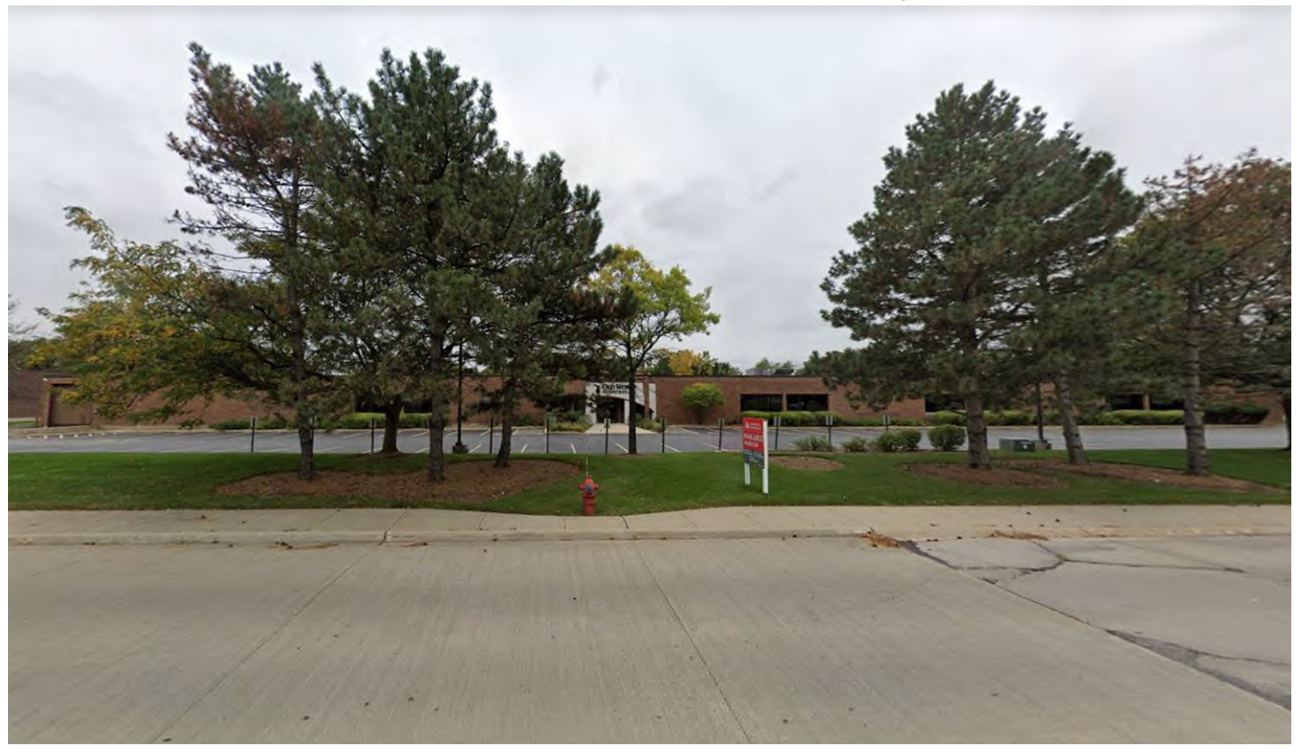
Street view on Commercial Ave. (facing east)