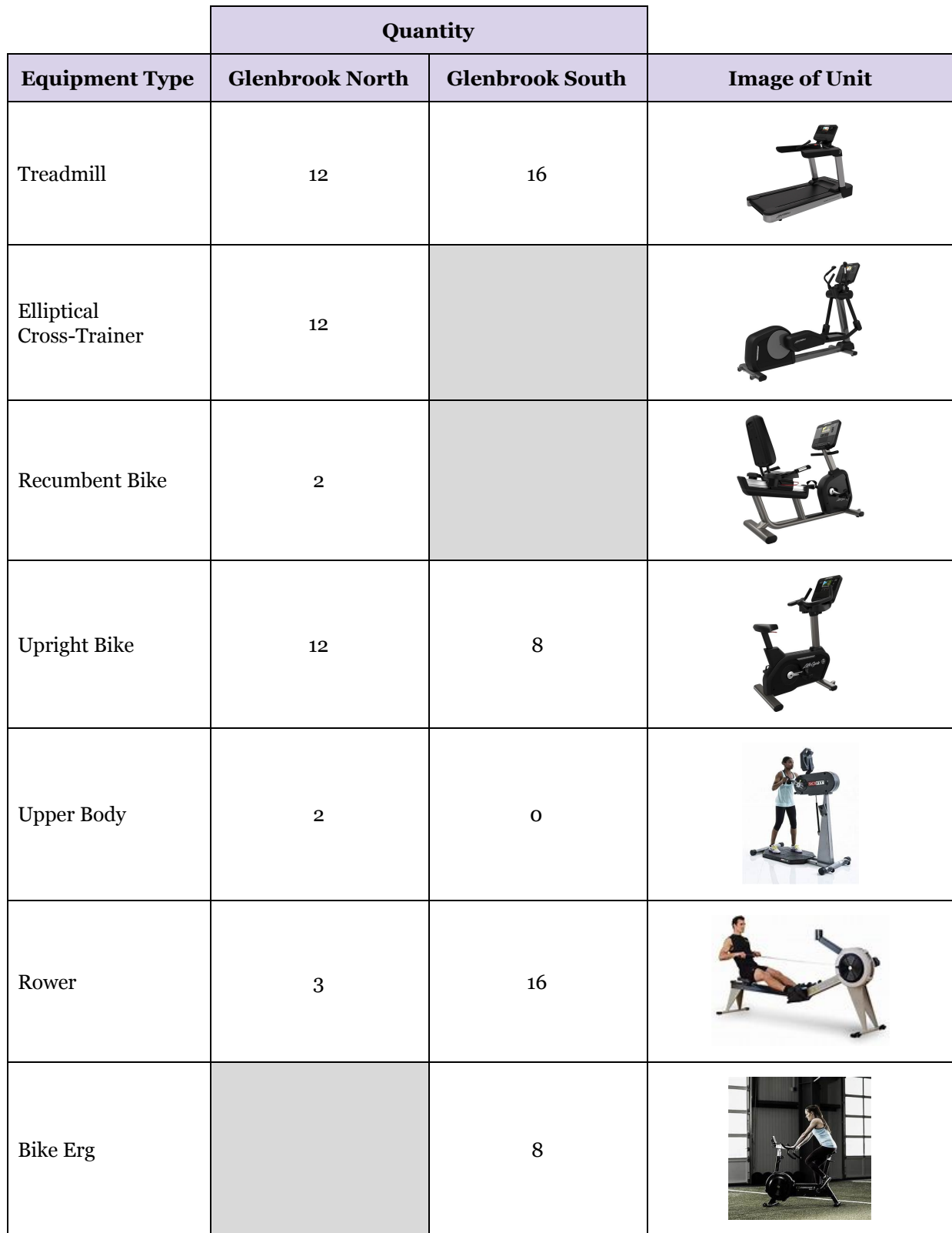
Table 1 Cardio Equipment Included within Bid