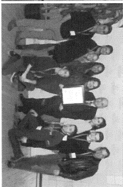
From left to right: During their 91st annual Convention in March, 2015, CSPA presented Silver Crowns to the staffs of the Cavalier Classic yearbook (Carroll County High School, Hillsville, VA) and The Circuit hybrid news (Cypress Bay High School, Weston, FL) and a Gold Crown to The Feather Online digital news (Fresno Christian Academy, Fresno, CA).

Gold and Silver Crown Awards will be publicly announced and presented to those winners who are present at the Convention on Friday, March 17th in the Roone Arledge Auditorium of the Alfred Lerner Hall Student Center, located on the Morningside campus of Columbia University. The Crown Awards are the highest awards bestowed by the Association upon publications as a whole.