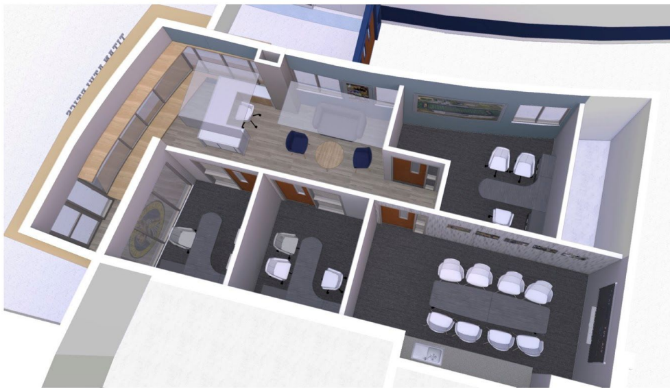
ARCON GBS Athletic Office Glenbrook High School District 225 Project No. 18126